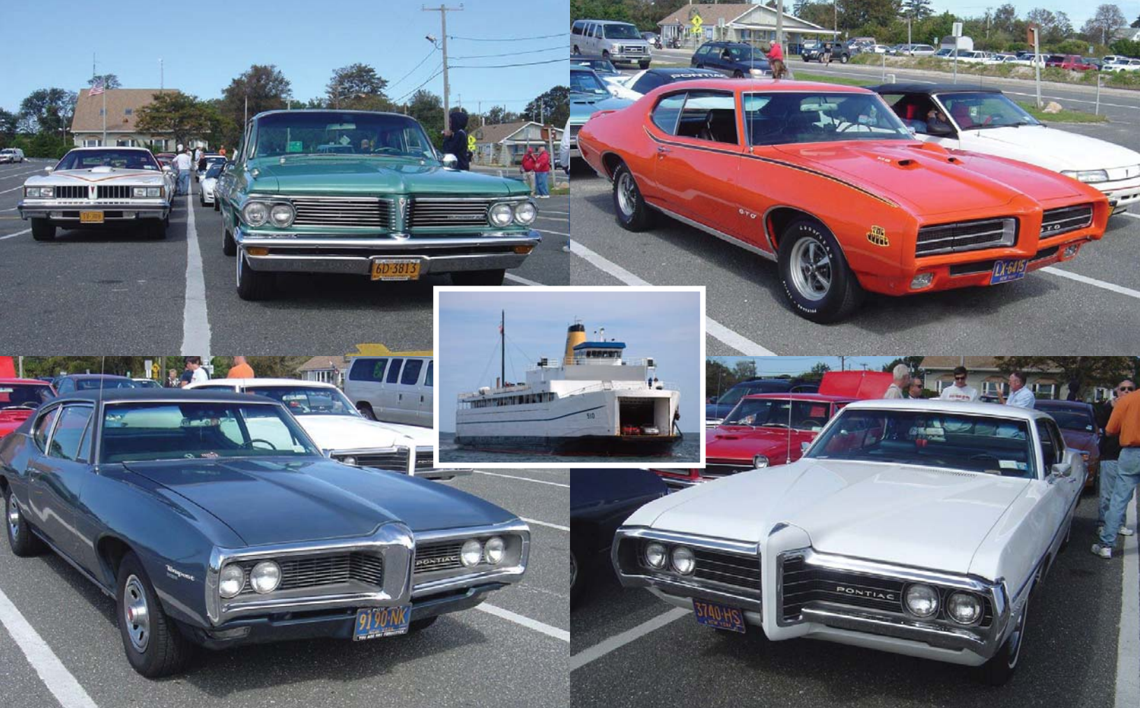
Long Island GTO Club of New York and the Long Island Pontiac Club- POCI stormed the Orient Point (east Long Island) ferry to hitch a ride to Connecticut for the Pontiac Celebration.

Saturday morning dawned a little on the hazy side, but all reports had been for sunshine throughout the day. And by mid-morning the clouds burned off, and the sun came peaking out for a wonderful show day. Registration stayed busy as new arrivals continued through the morning.