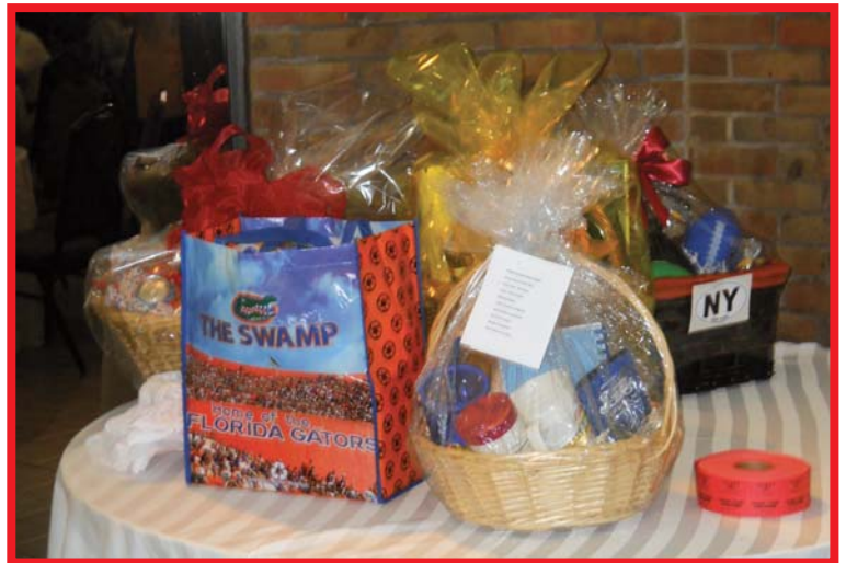
A new addition, and pleasant surprise to everyone, was the giveaway raffle of "State Baskets." State Baskets representing 13 attending states were given away as a "Thank You" from A Pontiac Celebration— 2012.