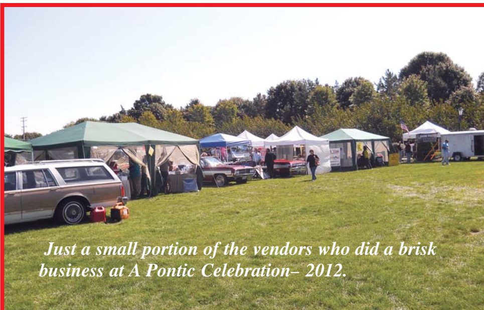
Just a small portion of the vendors who did a brisk business at A Pontic Celebration- 2012.

There were quite a few more vendors over 2010, offering everything from car items to arts and crafts. All reported brisk business, and a few even went home with "treasures" they hadn't expected to find. The seminars were a new addition, and we apologize for not having them as prominently displayed as we should have. While most were well attended, we, as organizers, learned how to do it better next time. Watch for even more in 2014!