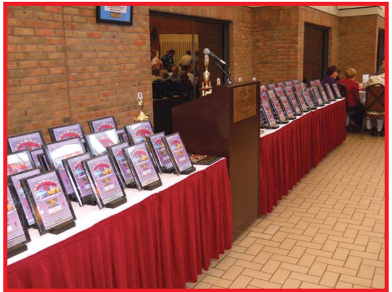
There was no shortage of beautiful, well deserving awards in many classes for excited participants.

Once again PontiacRegistry.com is happy, and proud, to host such an event for such a worthwhile purpose. Our thanks to all who helped make "A Pontiac Celebration— 2012" a huge success. See you all in 2014!